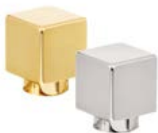
TOP CUBE CHAPE ALLI OR / ARGENT CACHE POMPE 15