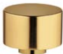
TOP PASSION CHAPE ALLI LESTÉ OR / ARGENT / NOIR BRILLANT CACHE POMPE 15