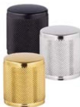
GATOR CHAPE ALLI OR / ARGENT / CDF / NOIR MAT CACHE POMPE 15